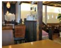
ICE MONSTER (Juhyo tree)